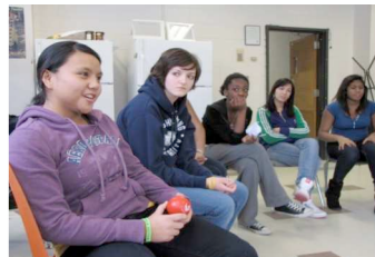
Students at West Hill participating in a Talking Circle.

2010-2011 looks like it's going to be an exciting year as well! We have several new schools on board. We are looking forward to working at Victoria Park C.I, George S. Henry, Thistletown and Central Commerce to name a few. We are pleased to be involved in developing roles for Peer Leaders in the new Focus on Success/ Why Try initiative. We'll keep you updated!