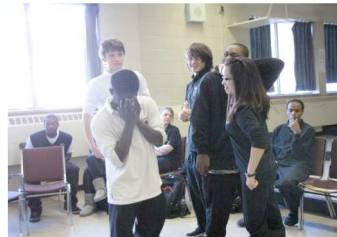
Peer Leaders at Runnymede using drama techniques in a workshop.

This program supports grade 9 students in their social/ emotional development during the crucial first year of high school.