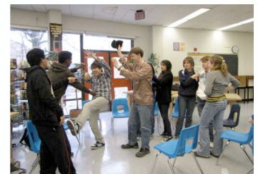
Peer to Peer contact at Sir Oliver Mowat

2010-2011 looks like it's going to be an exciting year as well! We have several new schools on board. We are looking forward to working at Victoria Park C.I, George S. Henry, Thistletown and Central Commerce to name a few. We are pleased to be involved in developing roles for Peer Leaders in the new Focus on Success/ Why Try initiative. We'll keep you updated!