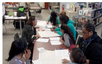
Bendale BTI Peer Leaders mentoring younger students