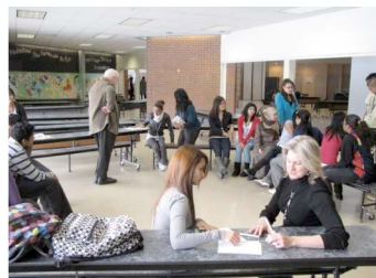
Students at Pearson CI brainstorming key issues and challenges.